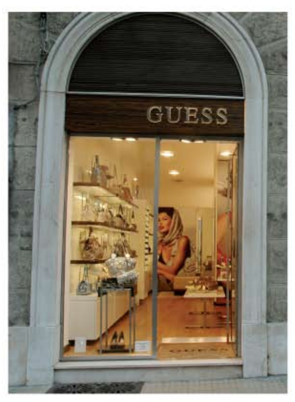
GUESS ACCESSORIES PISTOIA, ITALY