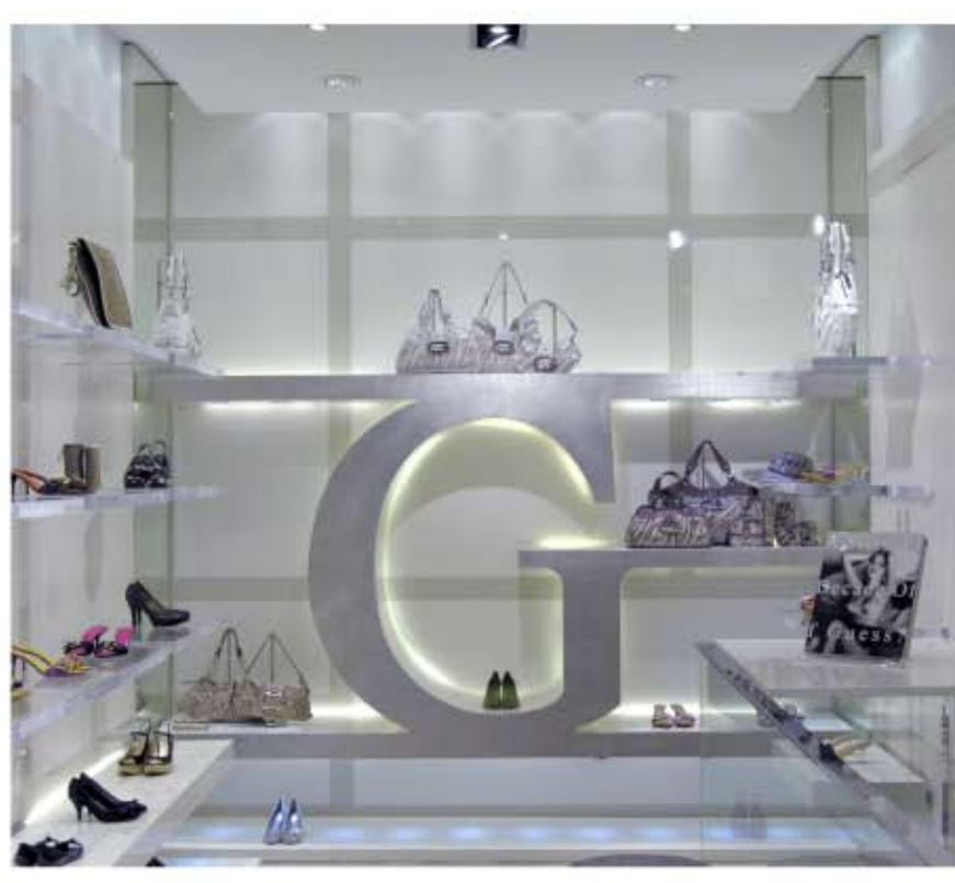
GUESS FOOTWEAR PARIS, FRANCE