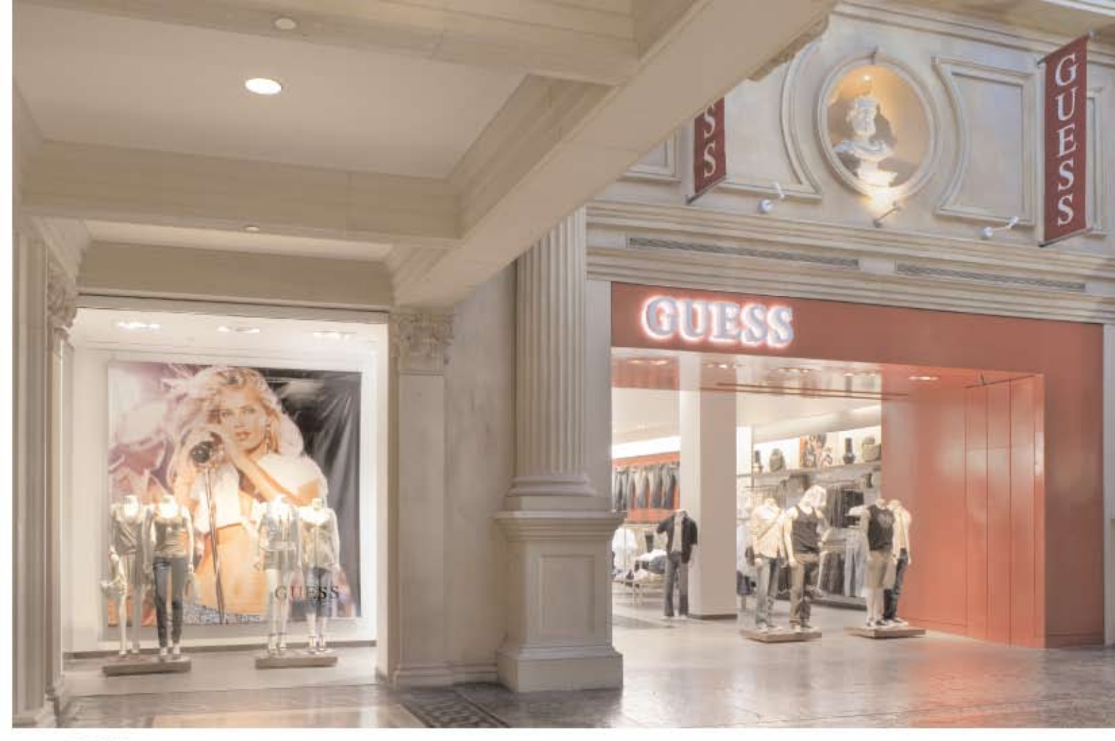
GUESS LAS VEGAS, NEVADA Caesar's Forum Shops