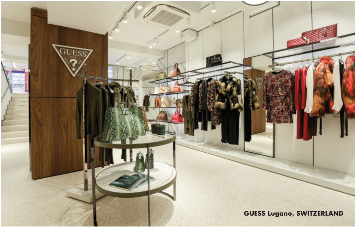
GUESS Lugano, SWITZERLAND