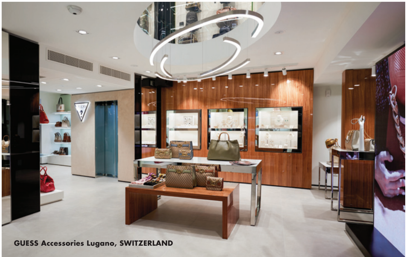
GUESS Accessories Lugano, SWITZERLAND