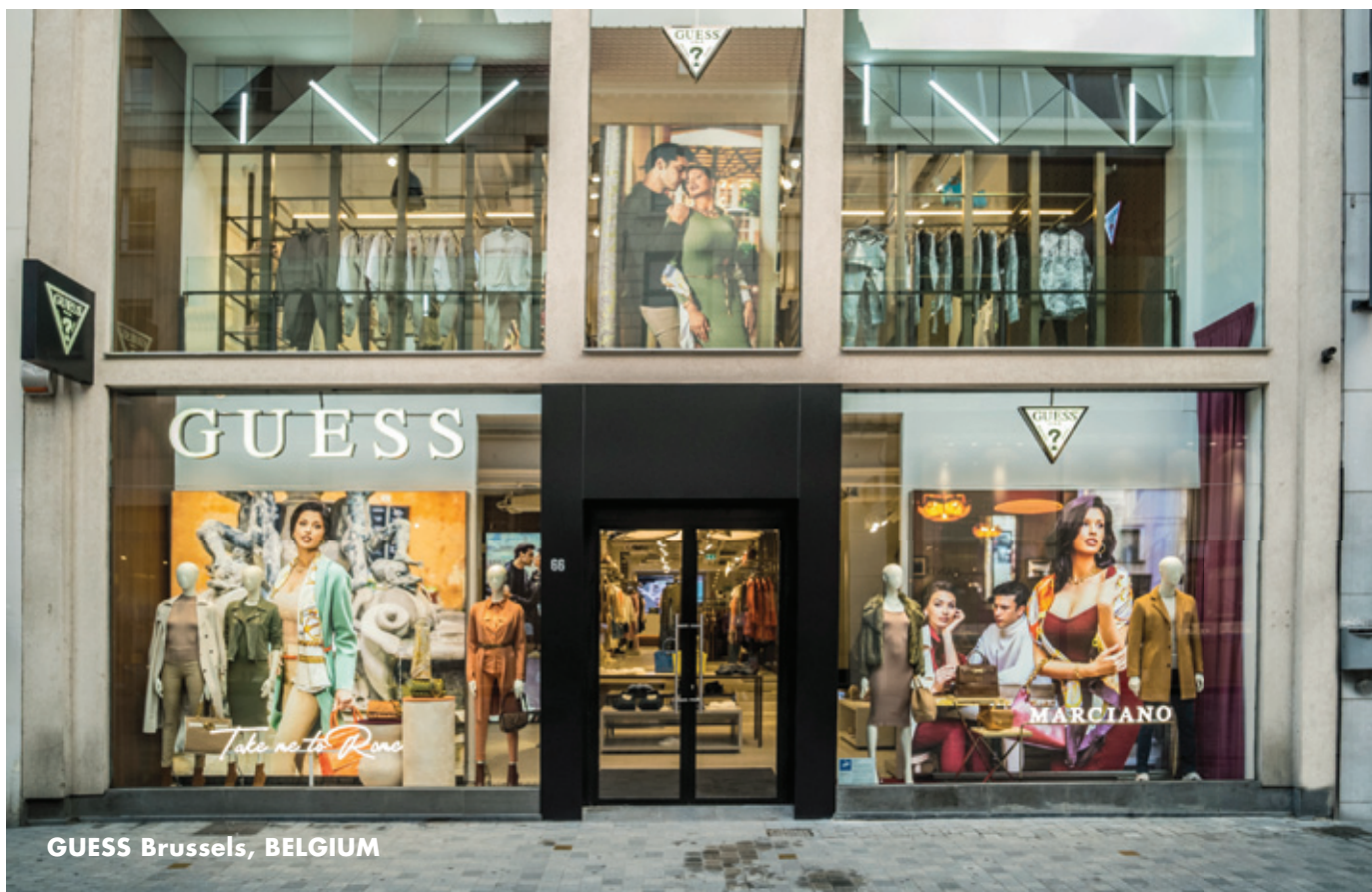
GUESS Brussels, BELGIUM