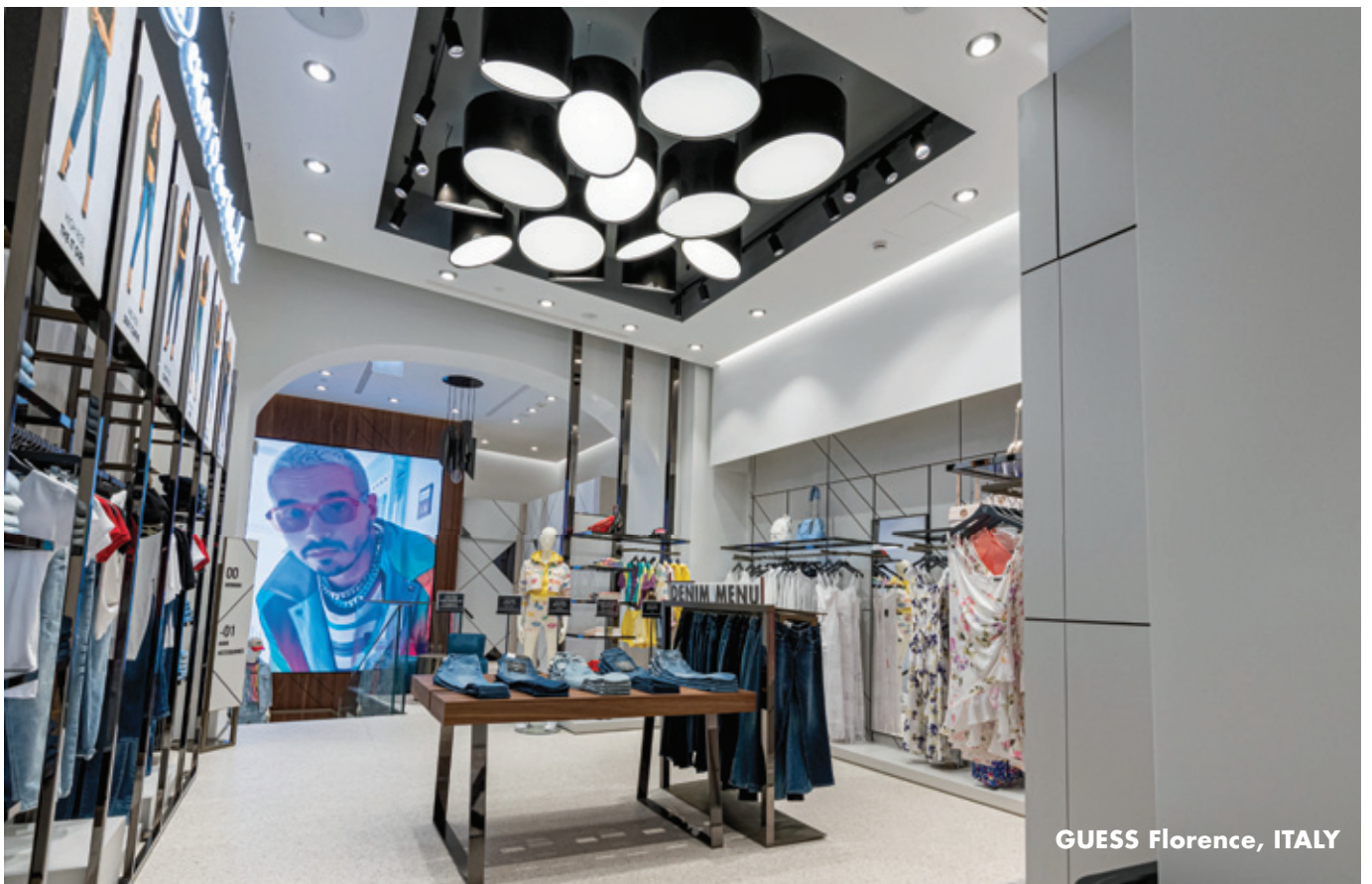
GUESS Florence, ITALY